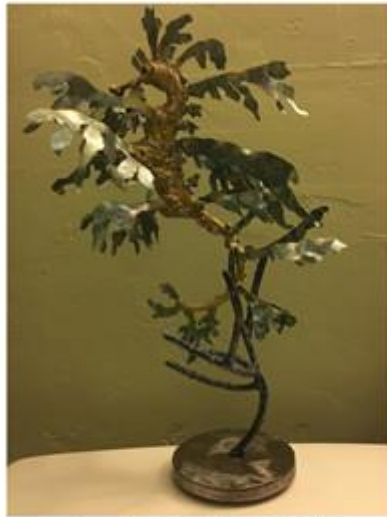
Leafy Seadragon (dh)