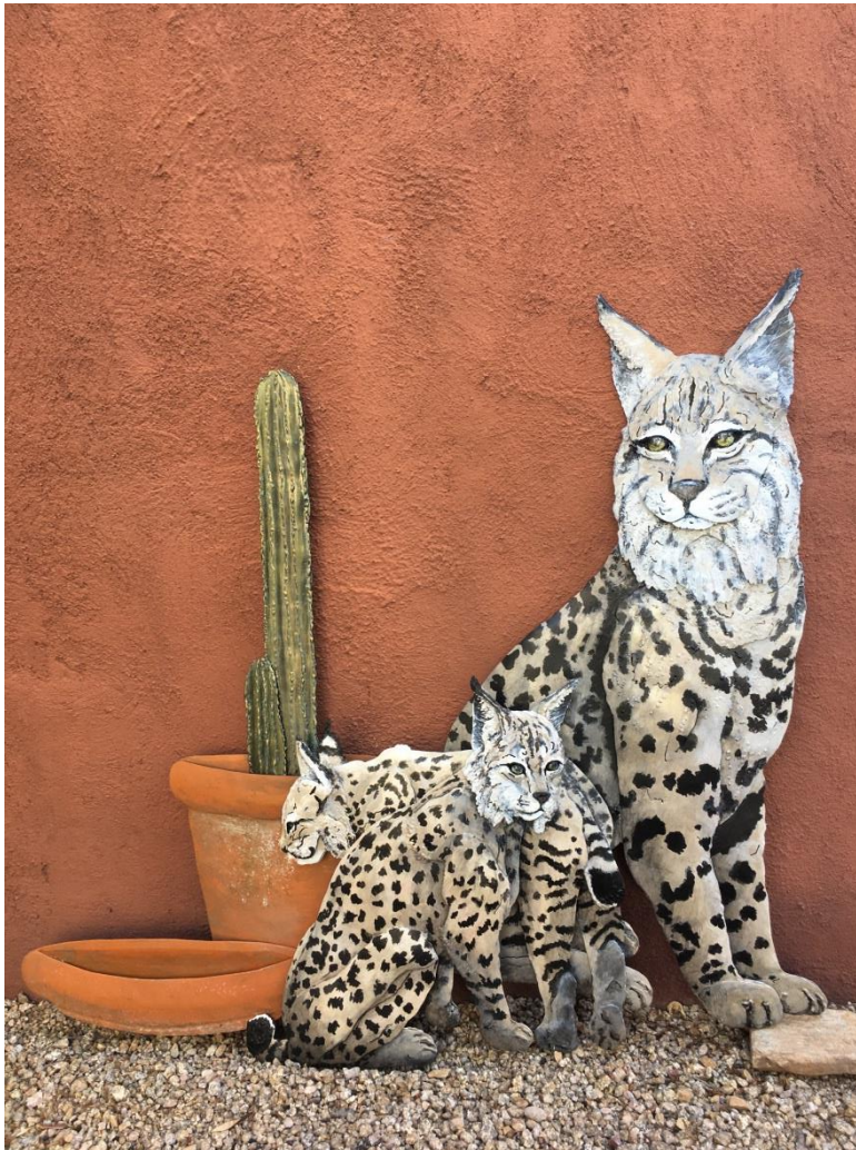
Mueller's Watering Hole

Spring? No, this is not a typo. I am calling a reboot of 2020. I was feeling a little traumatized by the daily bombs exploding in my normally happy existence. That was, until I remembered my mission: Make the world a brighter place one smile at a time! With this change of perspective, I realized I have a lot to smile about!