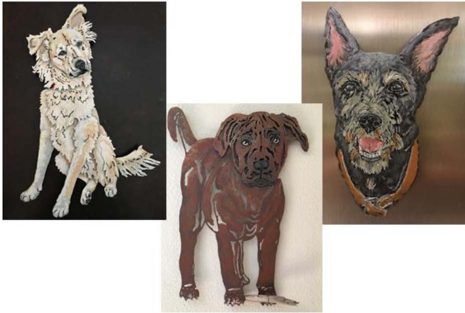
Stevie, Stanley, and Louis

There is still a little time left if you would like to commission a pet portrait for the holidays. Choose from three different styles: multi-layer, two layer, or vignette. (Let me know if you have a custom design idea).