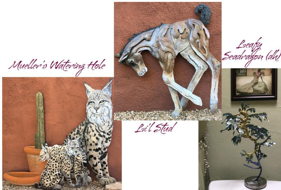
Mueller's Watering Hole