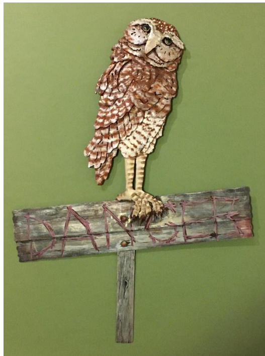
Feelin' Lucky...Well Are Ya...Punk

Most of the decorations have been stowed away, yet the lights remain aglow. I'm not sure why exactly, but I think it's because it makes me happy to see them sparkling in the dark. (There is a parallel there I am sure). Maybe my neighbors concur as I have never seen the street look quite so festive.